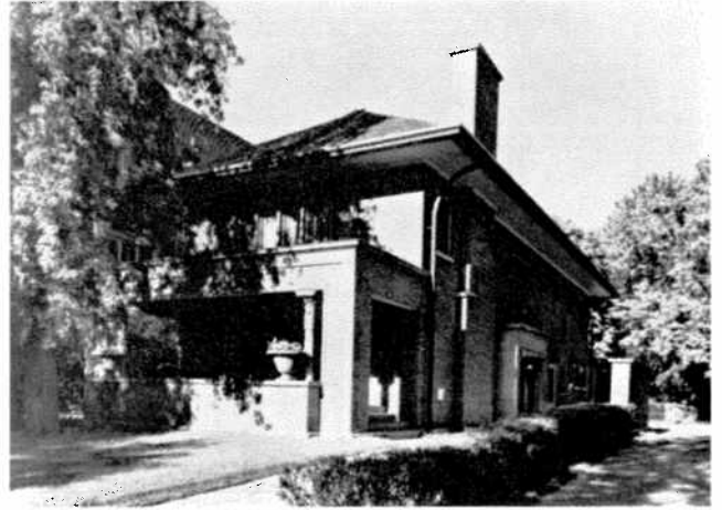
The Magerstadt House (above) is one of Kenwood's finest Prairie school houses. A single decorative motif, the poppy, is used throughout the design of the house. It appears in the columns and original light fixture on the front porch, as shown in the 1963 photograph below.

The major period of Kenwood's development, which had begun around the time of the Columbian Exposition, came to a close by the beginning of the Depression in 1929. By that time, Kenwood had assumed its present physical character. Large, well-built homes set on generous lots with broad and spacious yards defined the suburban nature of the center of the community, and row houses and fine apartment buildings defined its edges.